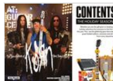
GUITAR CENTER VALID UNTIL NOV 30