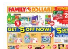
FAMILY DOLLAR EXPIRES TOMORROW