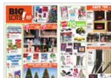
BIG LOTS SNEAK PEEK