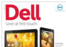
DELL US VALID UNTIL NOV 30