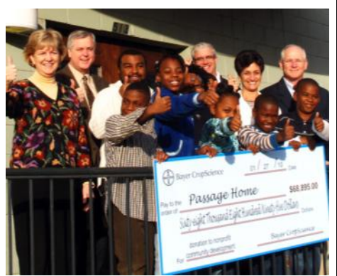
Started a partnership with Bayer CropScience to support the youth development programs and revitalization activities in Southeast Raleigh.