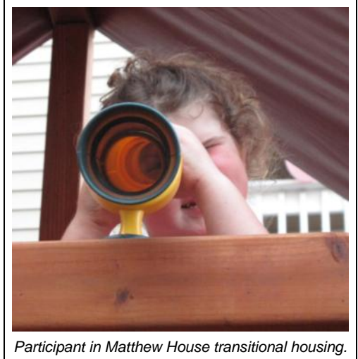
Participant in Matthew House transitional housing.