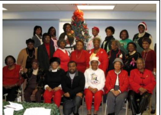
"Senior Teenager" group of neighborhood residents.