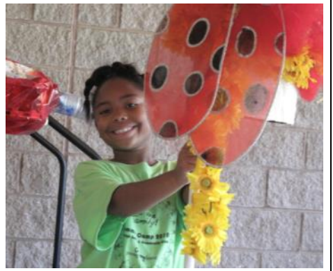
Summer Camp performance of the "Circle of Life" with Justice Theater Project.