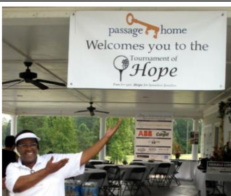
We hosted the first annual Tournament of Hope Fundraiser where we had a lot of FUN and raised a lot of FUNDS!