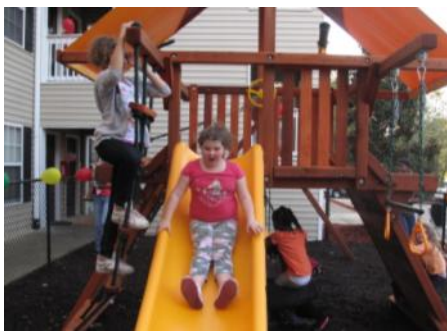
We celebrated the grand opening of a new playground for Matthew House!

Permanent Housing — Rent is set on a sliding scale to be no more than 30% of a participant's income.