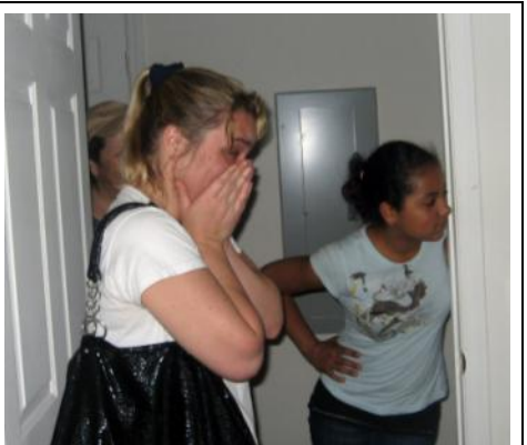
A new participant in transitional housing reacts to her new apartment that was decorated by St. Francis of Assisi through our "Restoring Hope" apartment adoption program.