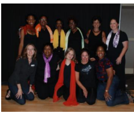
Harriet's House participants and graduates worked with the Justice Theater Project to write and act in a beautiful play that told their stories and offered education about the struggles that ex-offenders face.

We had a packed year in 2010 and were blessed by being able to work with so many supporting partners. This work could not be done without all of you. Here are just a few of the many wonderful moments we experienced.