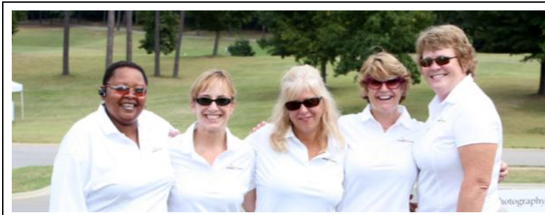
Volunteers at the first annual Tournament of Hope.

We are called to build strong communities by building healthy and vibrant families. We do this by providing long-term support aimed at achieving life-changing results. We offer an integrated and interconnected program of housing and social services. We dream that our families may one day reach out to serve others in need. We do all we can to guide families to lives of self-sufficiency and hope.