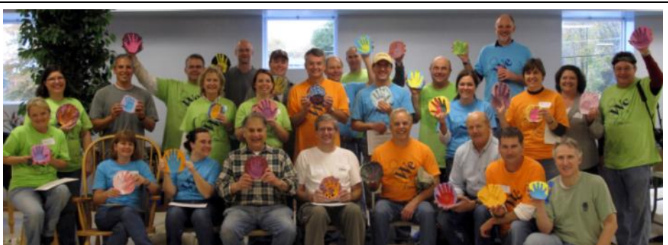
Volunteer group from Bayer CropScience who completed a day of service at the Raleigh Safety & Community Club.

*We received an additional $1,111,270.86 from the NC Dept. of Commerce for the Neighborhood Stabilization Program.