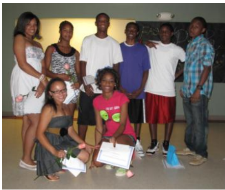
Counselors In Training (CITs) at the Summer Camp Fashion Show.

Currently, our focus is in Southeast Raleigh in the neighborhood surrounding our community center, the Raleigh Safety & Community Club. We are investing in both people and place by offering a community gathering space, a Kindergarten-to-college youth development program, employment assistance, senior services, and are working to strengthen our housing revitalization efforts in the upcoming year.