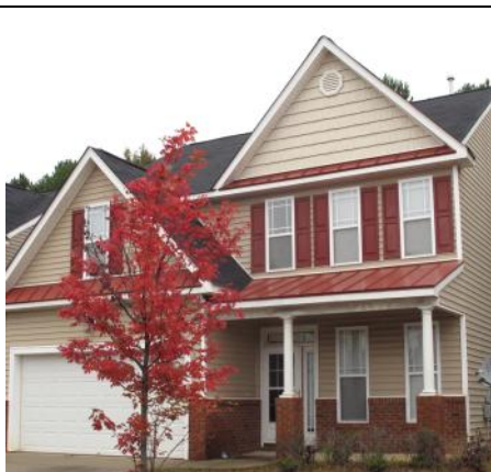
A home available for sale through the Neighborhood Stabilization Program.