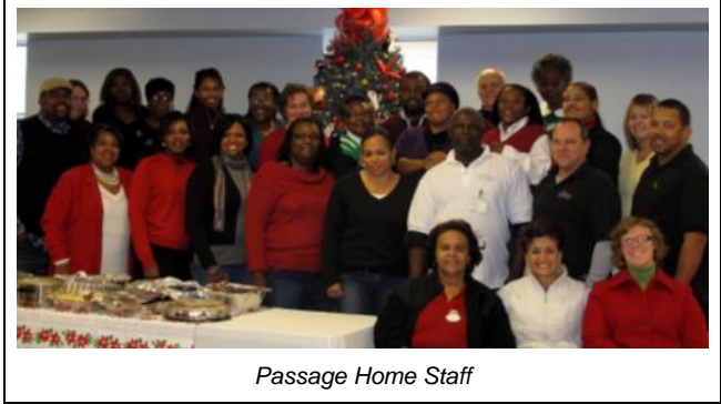
Passage Home Staff